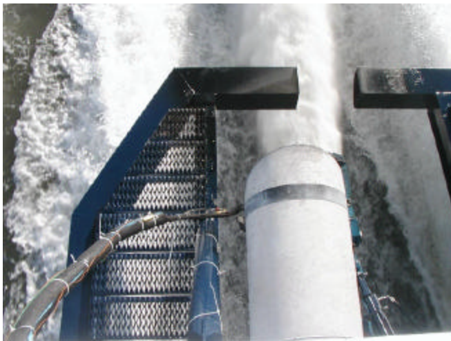
Figure 2: Sample line to the port main engine exhaust, high speed cruise conditions, Mare Island