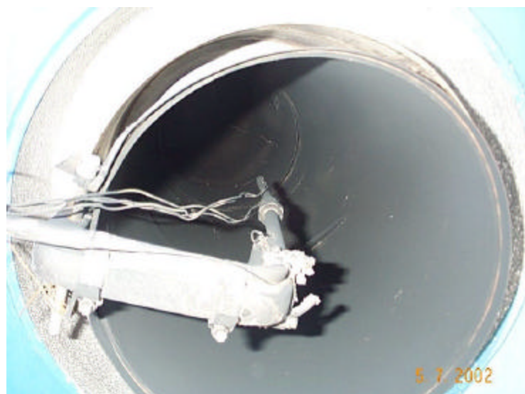
Table 6: Emission tests performed aboard Peralta