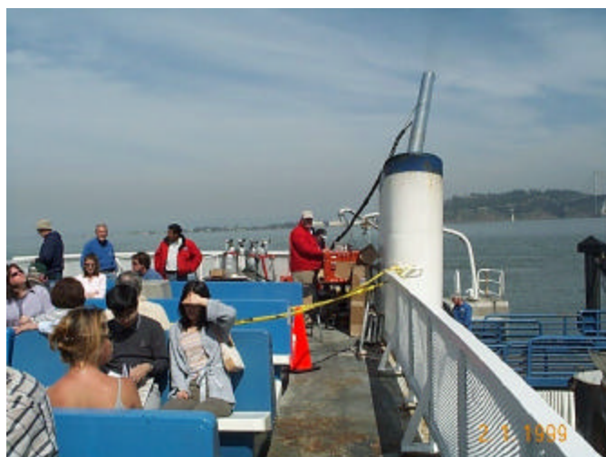
Figure 6: RAVEM system and exhaust pipe extension installed aboard Golden Gate

The emission tests conducted during March 20 and 21, using California diesel fuel, are listed in Table 10. A total of 25 tests were completed during the two days of testing. Tests 23