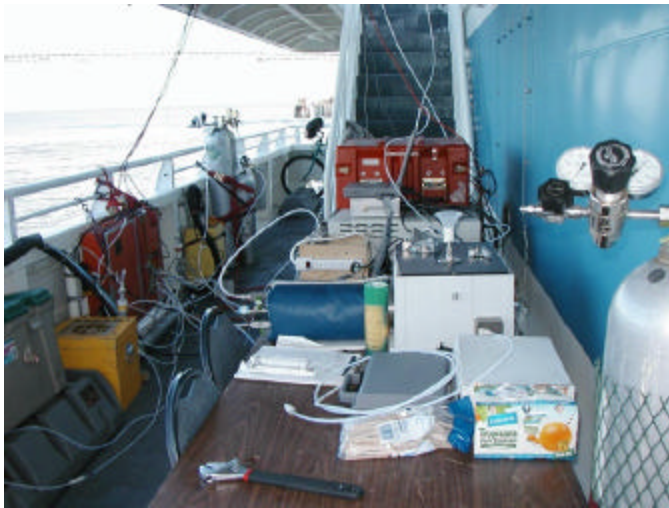
Figure 1: RAVEM system and auxiliary equipment installed aboard Mare Island .

Emission testing aboard Mare Island took place during March 14 and 15, 2002. The RAVEM system and auxiliary analytical equipment were installed outside on the lower afterdeck, immediately adjacent to the main engine exhausts (Figure 1). This space is normally used for bicycle storage - passengers are not normally allowed on the lower afterdeck when the vessel is underway. The CVS system is on the left side of the picture, next to the rail, while the gas analyzers and FTIR system can be seen on the table in the center of the photo.