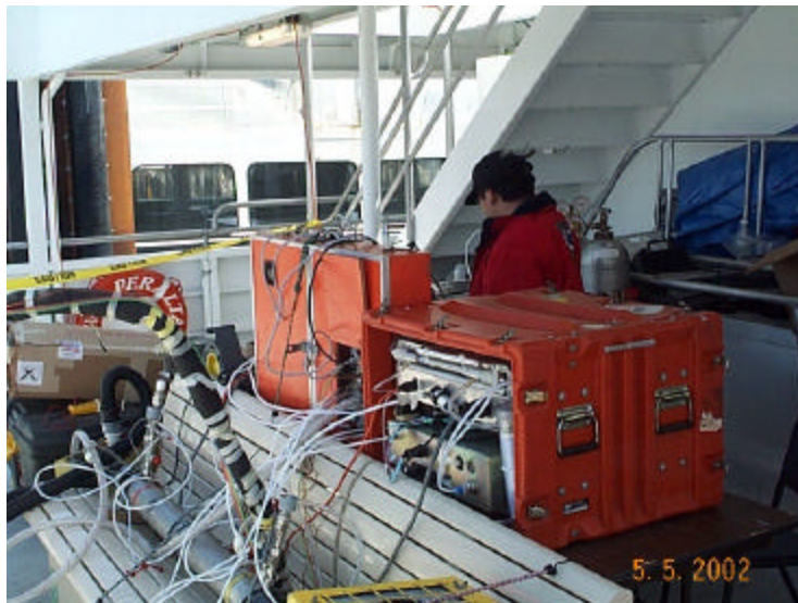
Figure 4: Installation of the RAVEM system aboard Peralta

Emission testing took place during May 5 through 7, 2002. It was originally planned to take only two days, but the tests performed on May 5 had to be discarded, as a leak was discovered in the CVS system that invalidated the results. The test schedule was therefore restarted on May 6, after the leak was corrected. A total of 18 valid tests were completed on May 6 and 7; these are listed in Table 6.