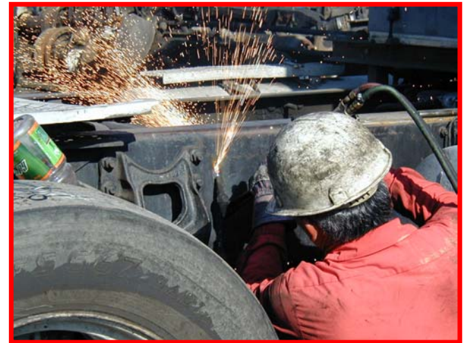
Gateway program truck undergoing scrappage process.